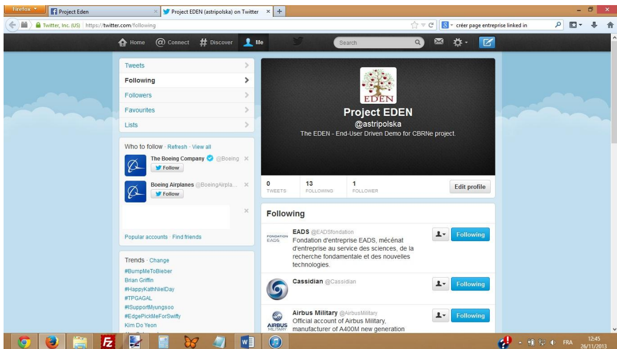
Fig. 3 Project EDEN Twitter

The project EDEN account was created on Twitter. The print screen of the account home page is presented below. We have suggested some tweets to follow, further development of the network will be done as well as the creation of our own tweets.